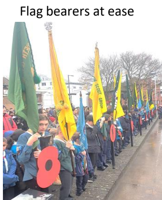
Flag bearers at ease