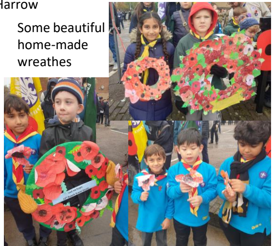
Some beautiful home-made wreaths