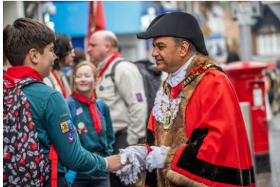
Meeting the Mayor

Despite the clash with the Diwali festival, we had a good turnout for the Remembrance Parades in both Harrow and Pinner, and I hope groups who joined more local events did too. For Harrow we had more than 250 members for the final event at the old Harrow Civic Centre. By November 2024 the War Memorial will be moved to a new location and we will have a new route to march. Well done to everyone who took part in a Remembrance Event on a rainy Sunday.