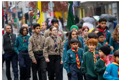
Marching through Harrow