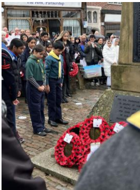
The Pinner ceremony